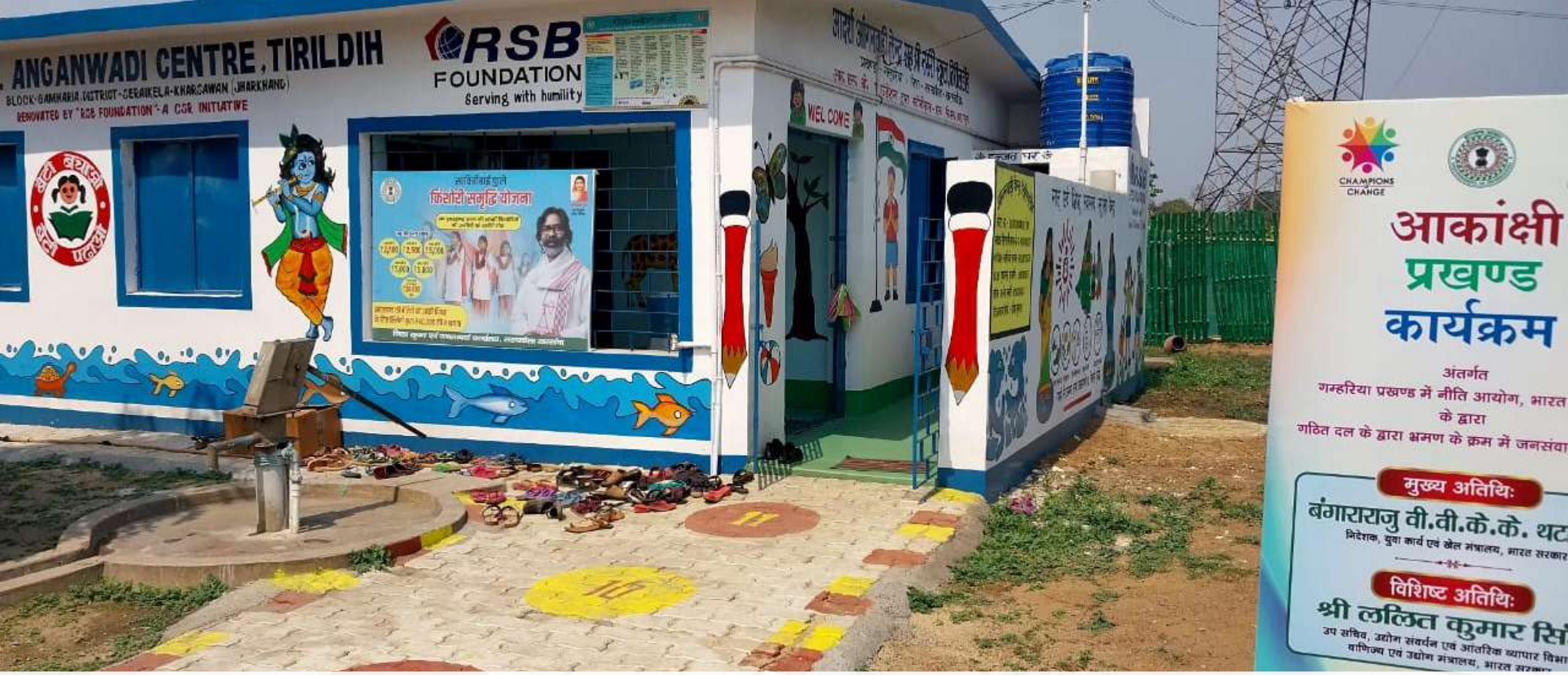
Tirildih ,Gamharia Block, Seraikela District,Jharkhand