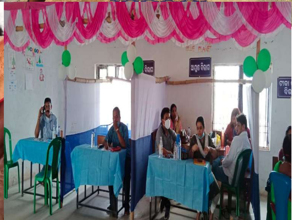
Shri. Prasanta Behera, MLA, Choudwar-Cuttack