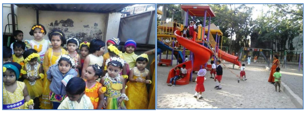
It's time for out-door fun-and-frolic for little have-nots