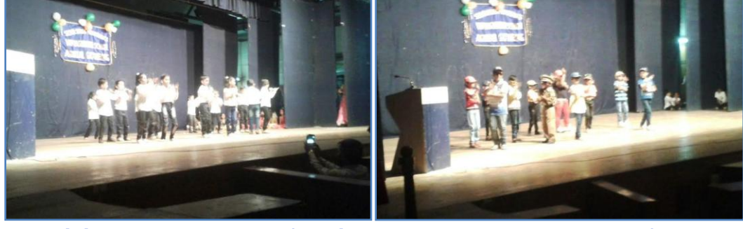
Under-privileged students performing stage drama on the eve of Annual Day