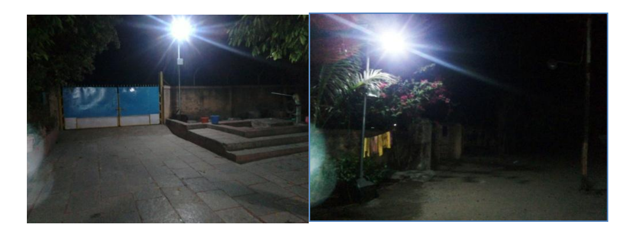
Solar lamps given by RSB glowing during the night time at Hostel