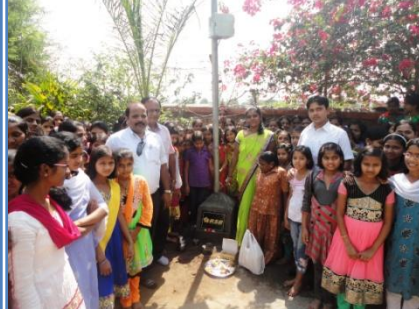
Traditional handing over of lamps by breaking a coconut/puja(left & middle) & Tribal Hostel children posing for photo shoot with beaming smiles (extreme right)