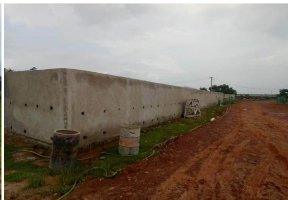
Construction work in progress as part of expansion – class room and compound wall (end Sept 18)