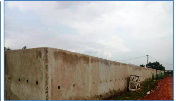
Clockwise: Class Rooms & Compound Wall completed(end Mar 18)