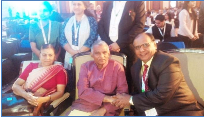
With Dr Padmashree Baba Amte, Chief Guest & Magsaysay Award Winner & global icon In Social Responsibility